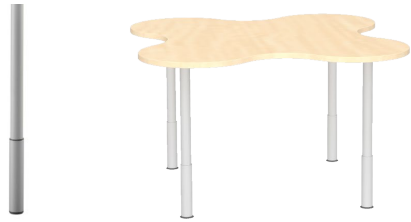
Matrix I Leg

The Cloud tabletop can be combined either with the Matrix I Leg or Summa Leg. Height options are: 710 mm / 730 mm / 830 mm.