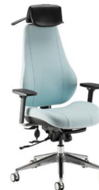
Step+ F37C + armrest + coat hanger (C= lumbar support)