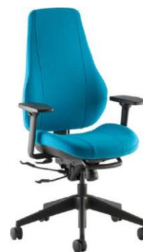
Step+ F26+ armrest