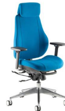
Step+ F24 + armrest